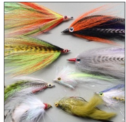
These flies by Ron Barefield will be one of the auction items